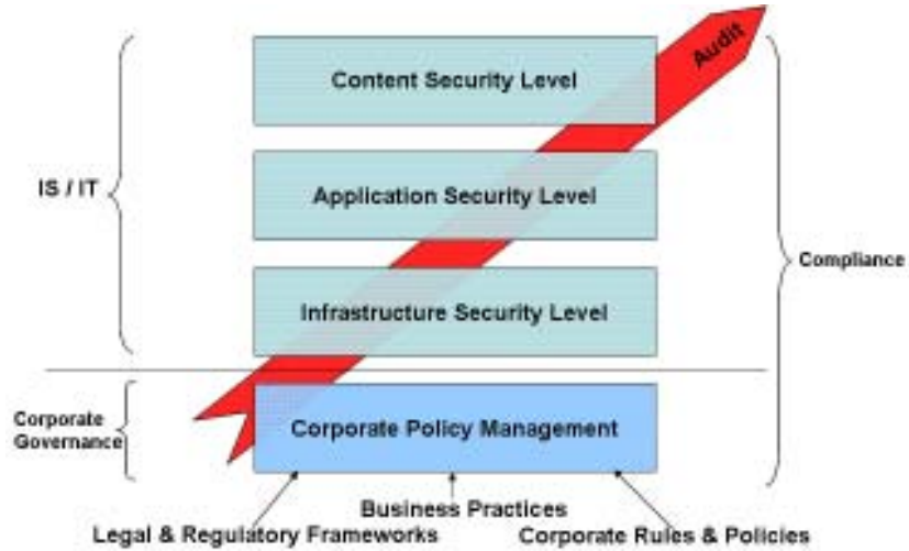
Figure 1. General Framework for Corporate Policy Management

Given such a framework, it provides the means to analyze those policies in order to determine the ones that can be partially or fully digitally instrumented by technologies such as DRM at IT and IS level. To be noted that definitely not all policies can map to technical solutions. A good example of this would be the notion on “intention” when accessing a report for